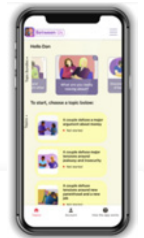
Between Us App for LAs

Access is gained through a dedicated portal, allowing your practitioners access to a bespoke version of the app for your local authority.